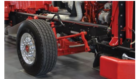
F-Shield Corrosion Protection