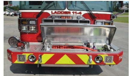
Custom front bumper storage, hose and equipment