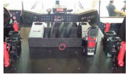
Custom map book holders