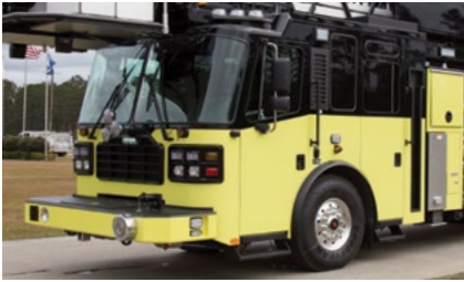
Black out package