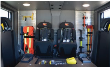
Custom wall equipment storage