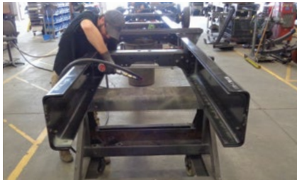
Double and triple channel, heat treated frame rails