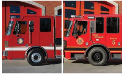
Barrier cab doors