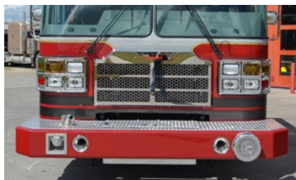
Heavy duty frame rail front bumper