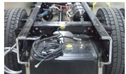
Double channel, heat treated frame rails