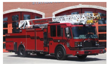
Black out package