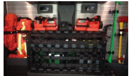
Custom wall equipment storage